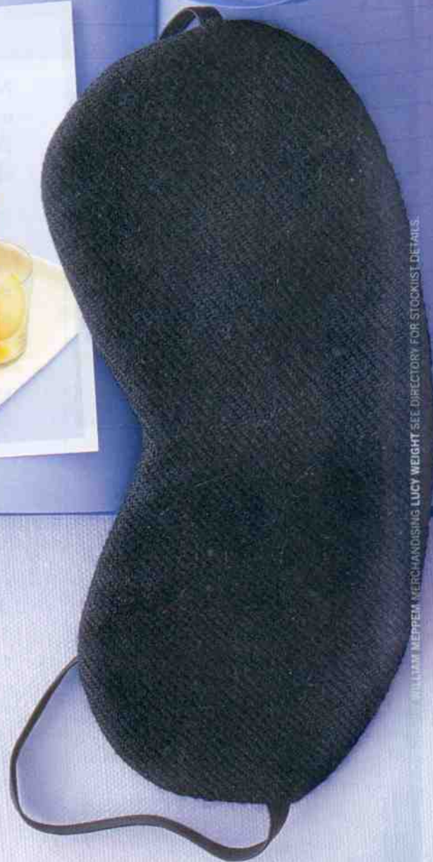
WILLIAM WEPPEL MERCHANDISING LUCY WEIGHT SEE DIRECTORY FOR STOCKIST DETAILS.